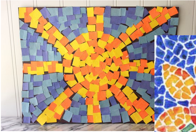
Easter Paper Cross Mosaic