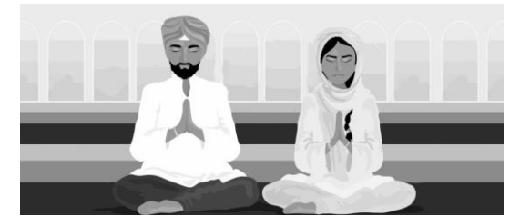
Langar – a place to eat in the Gurdwara.