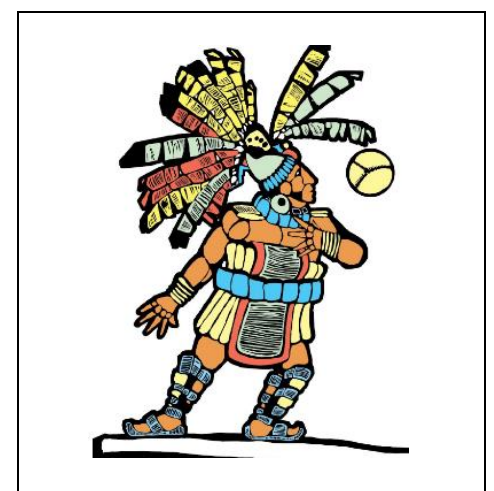
Pok-a-Tok—A ball game that was often played to settle disputes between neighbouring cities.