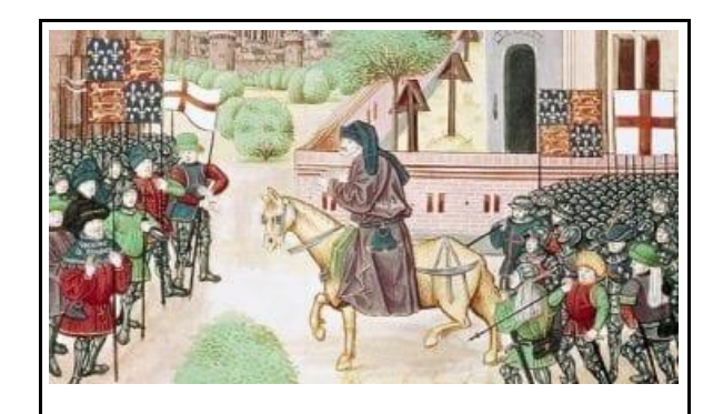
The Peasants Revolt 1381