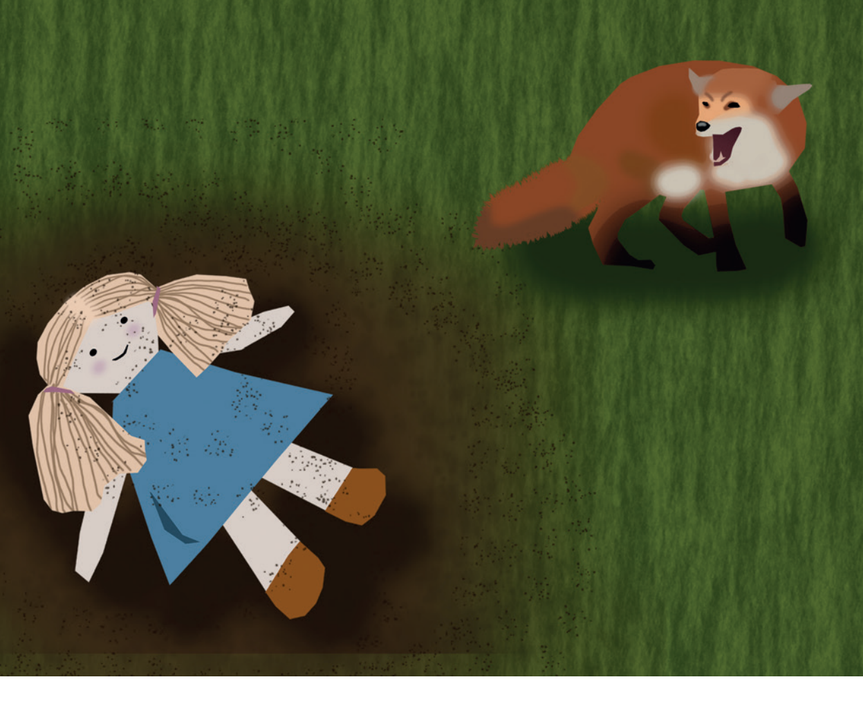
Fox huffs and puffs. Fox is mad at Jess.